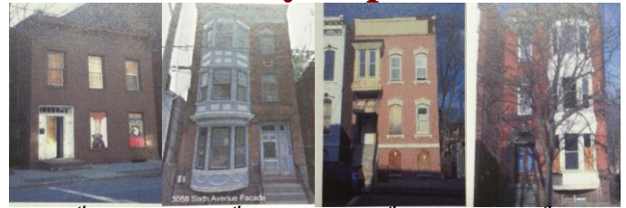
3056 6 th Ave 3058 6 th Ave 3270 6 th Ave 3320 6 th Ave

The Vacant Buildings Committee of Troy has been very active in preparing selected vacant buildings for sale by the city. A few weeks ago committee members and other volunteers cleaned out 3056 6 th Avenue, and in the process filled a large dump truck to the point in which it was overflowing with furniture, appliances, carpet and other assorted debris.