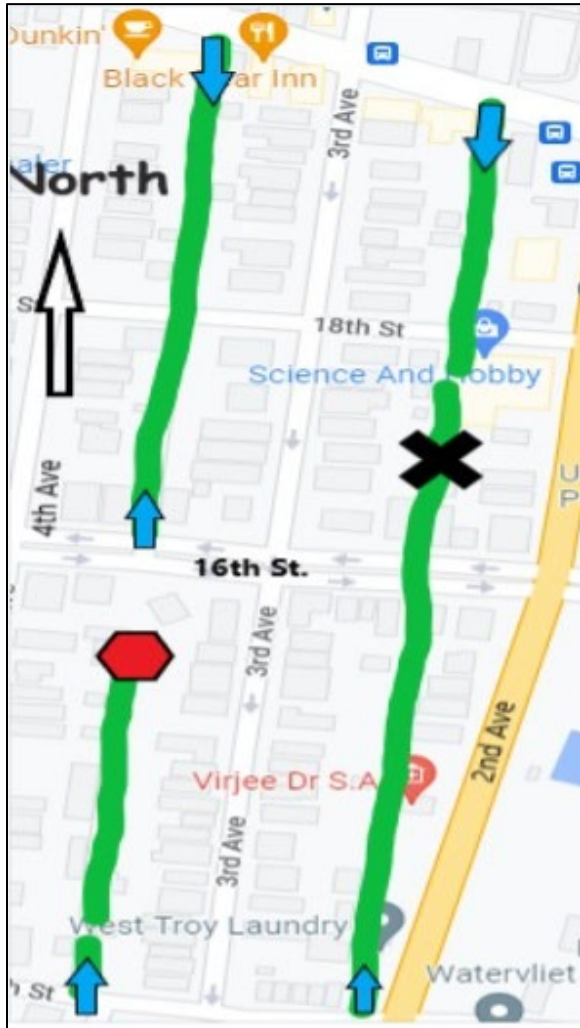
Map 1 - Watervliet 3rd Avenue Alleys for Earth Day Cleanup. The alleys are located behind the west side properties between 3rd Ave. and 4th Ave. and behind the east side properties between 3rd Ave. and 2nd Ave.

Hobby store located on the corner of 2nd Ave and 18th St., but it is subject to change . DO NOT PARK THERE, only walk there to meet the group. We will confirm the meeting spot in later communications. You may park your vehicle on any street in the vicinity and make the short walk to our meeting spot.